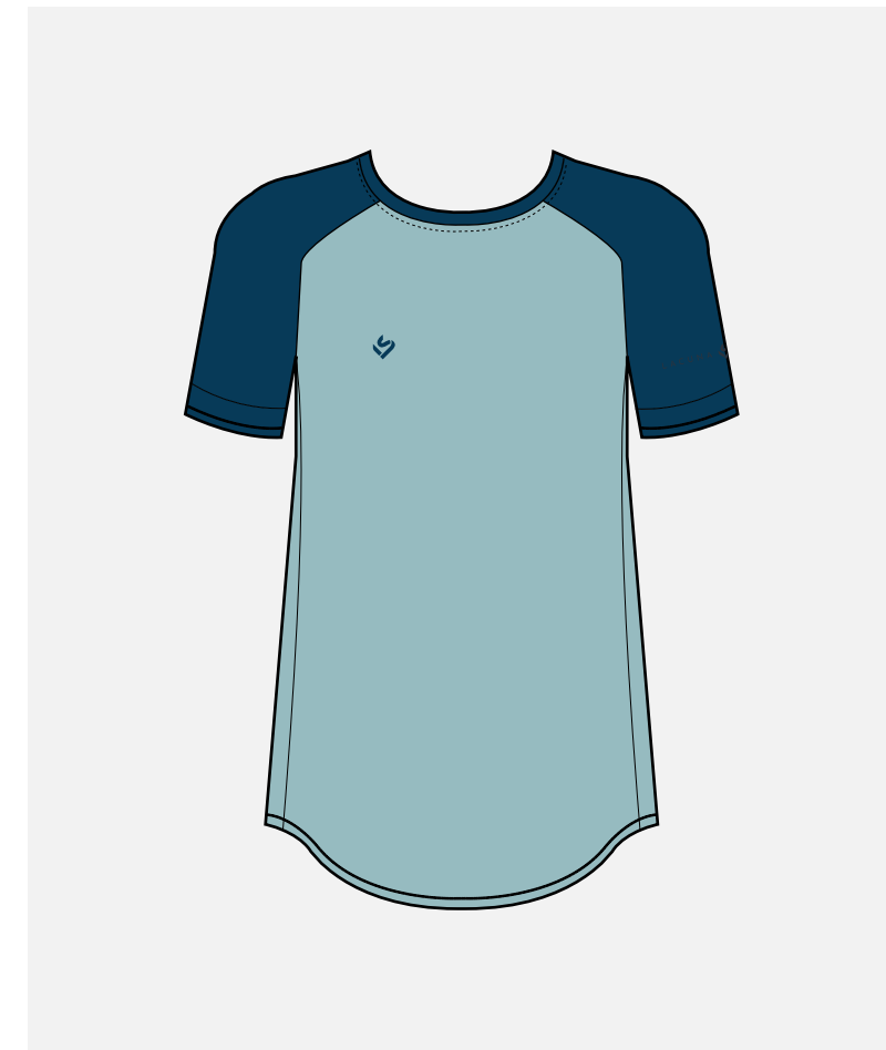
Short Sleeved TShirt