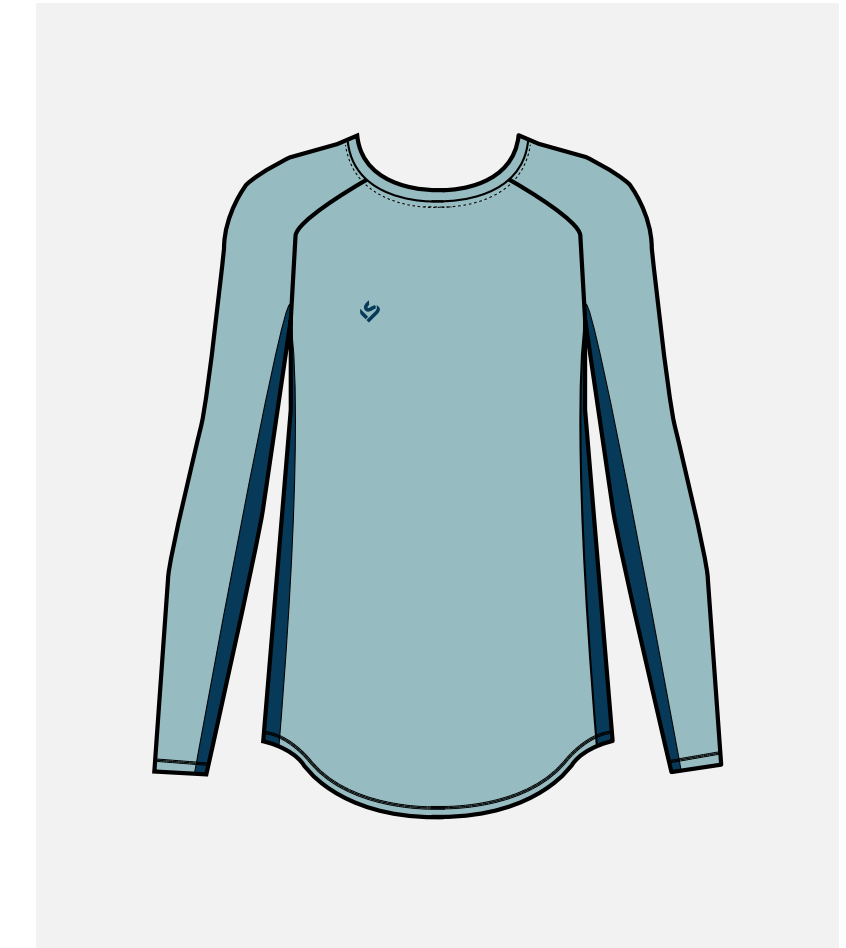
Long Sleeved TShirt